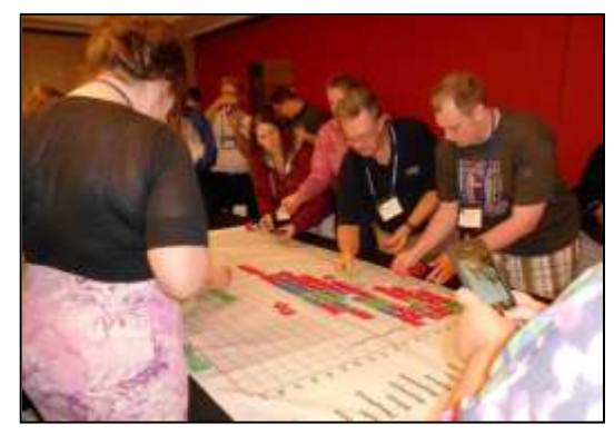
the ANS National Teachers Workshop. The Chart was also lent to Penn State University for Teachers Workshops held over the summer.